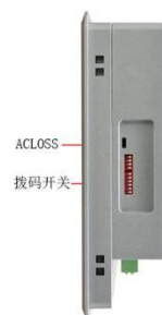
侧面 I/O 视图