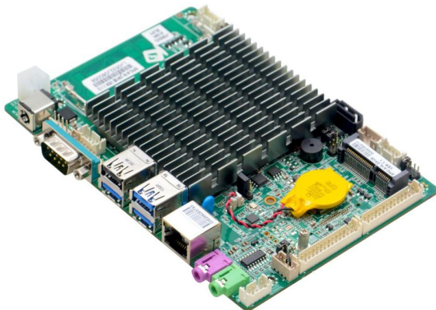
EPIC-A19_D912E VER:1.1 主板侧面图