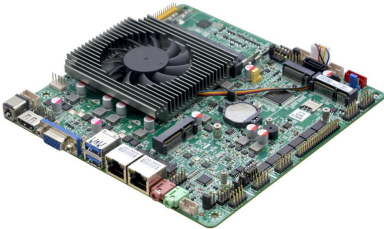
ITX-B82_I526L VER:1.6 主板侧面图