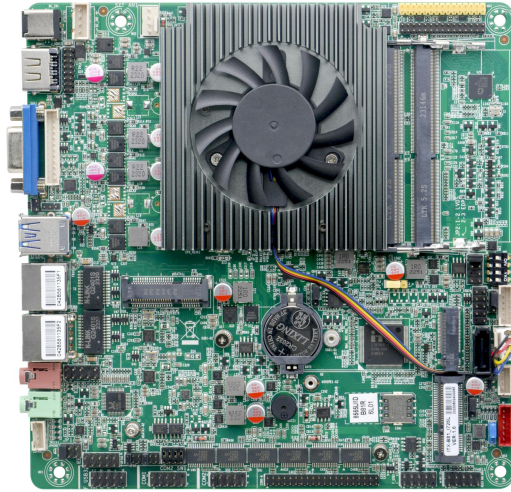
ITX-B82_I526L VER:1.6 主板正面图