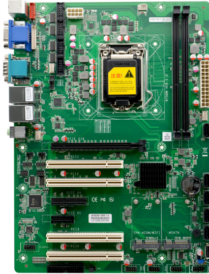
B75DM VER:1.0 正面图