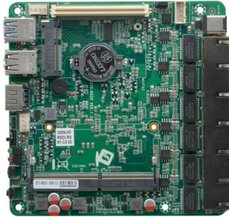
STX-R52V VER:1.0 正面图