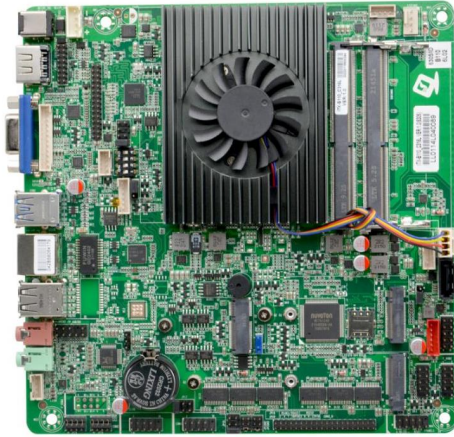
ITX-B110_C316L VER1.0 正面图