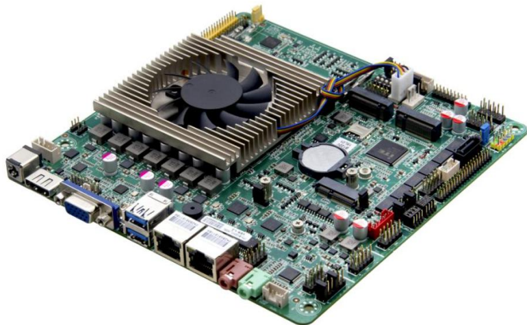
ITX-B120V1_I526L VER:1.0 主板侧面图