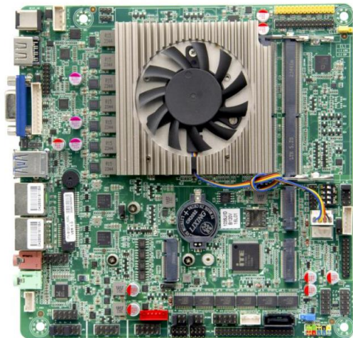
ITX-B120V1_I526L VER:1.0 主板正面图