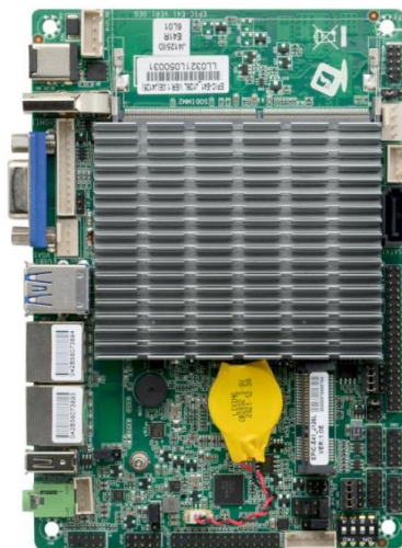
EPIC-E41_J126L VER:1.1E Front View