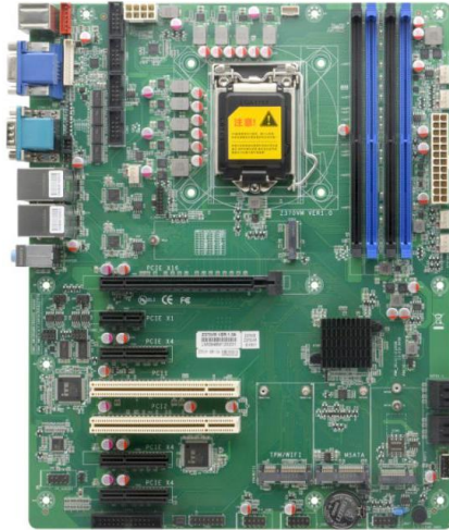
Z370VM VER:1.0A 正面图